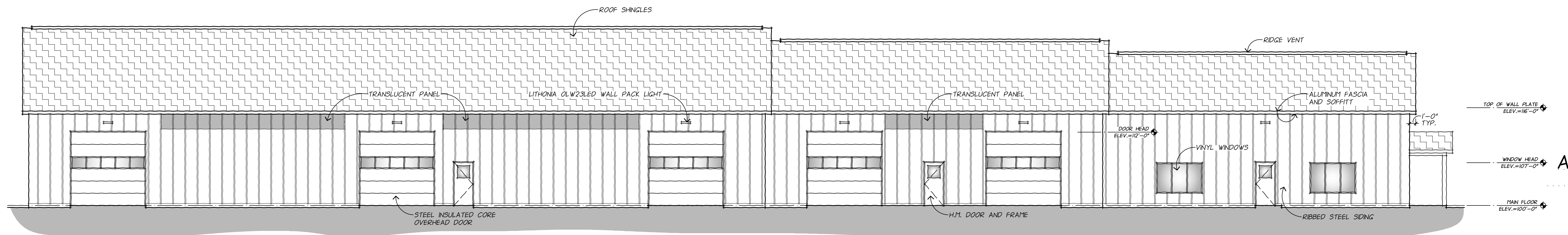
MAINTENANCE FACILITY - EAST ELEVATION SCALE: 1/8"=1'-0"

SUP/See Plan Approval 12-14-16 ..... date 1616 ..... commission A2.1 ..... sheet