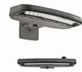
LITHONIA OLW23LED WALL PACK LIGHT