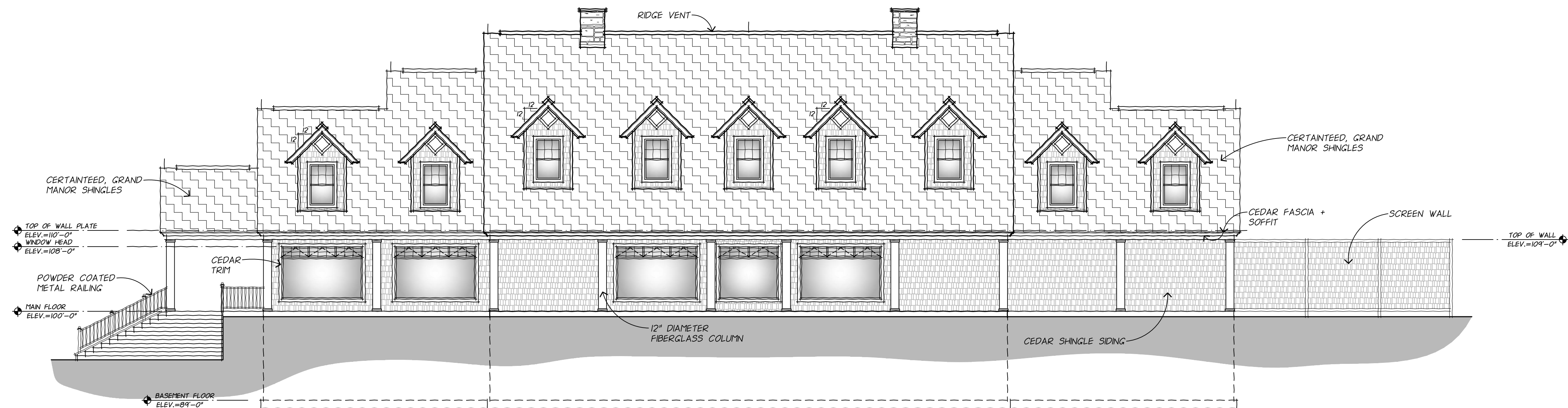
WEST ELEVATION SCALE: 1/8"=1'-0"

SUP/Spec Plan Approval 12-14-16 . . . . . date