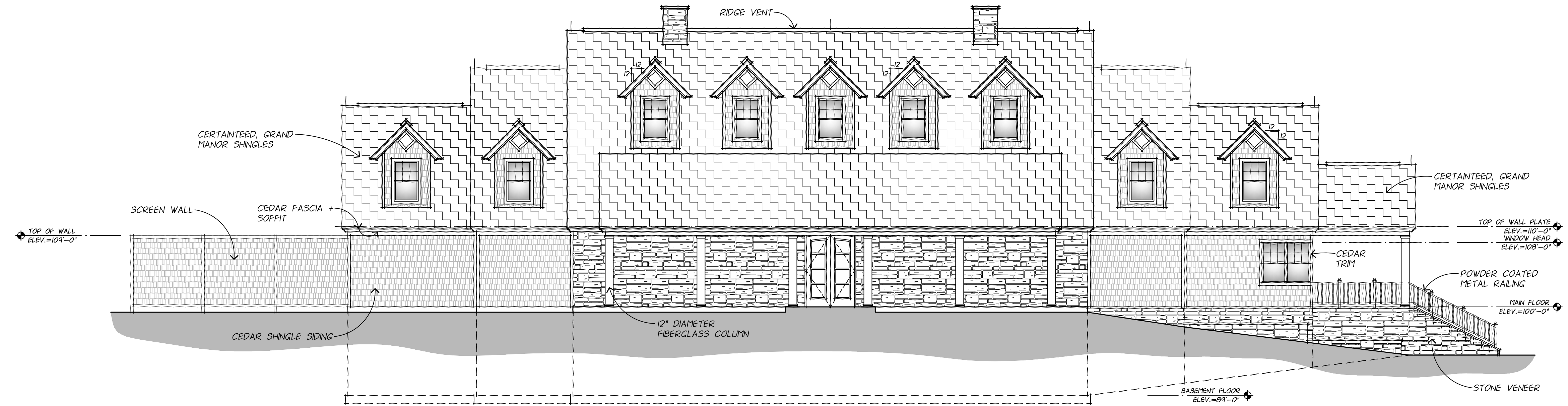
EAST ELEVATION SCALE: 1/8"=1'-0"